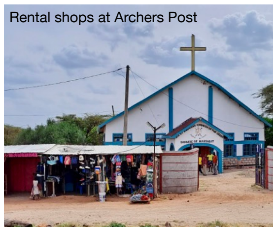
Rental shops at Archers Post

Please pray for their safe release, for good rains to increase people's resources and for the peacemakers